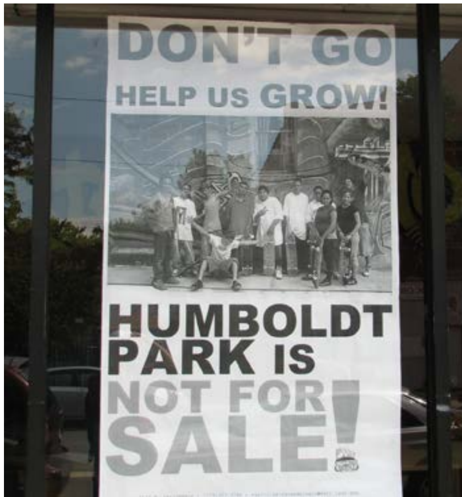
Fister, B. "Not For Sale!" July 2009