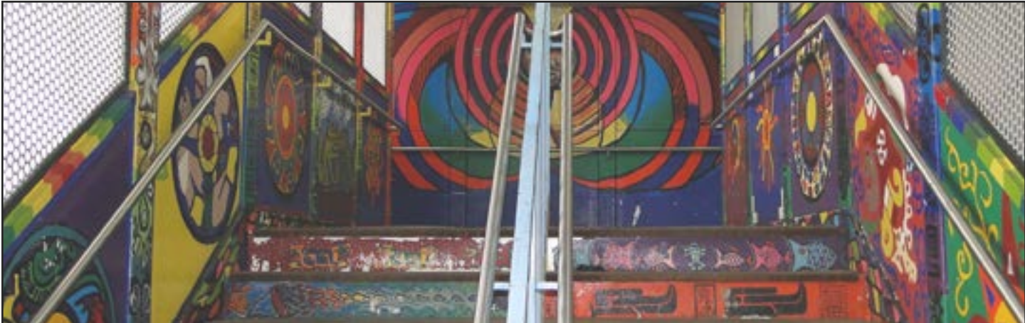
Jones, A. "18th Street L Station" April 2011