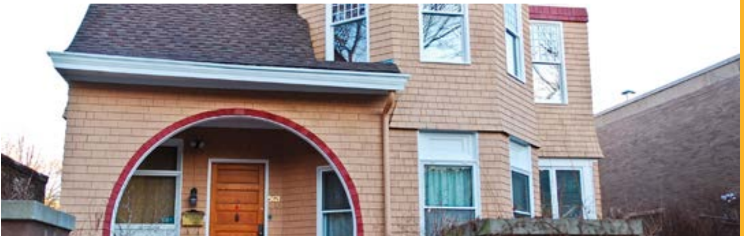
Rogers E.A. "House of the Day", January 2012