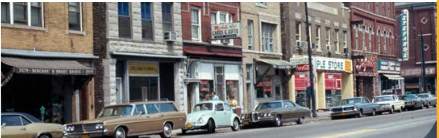
Brubaker, C.W. "West Chicago Ave. Businesses" 1970